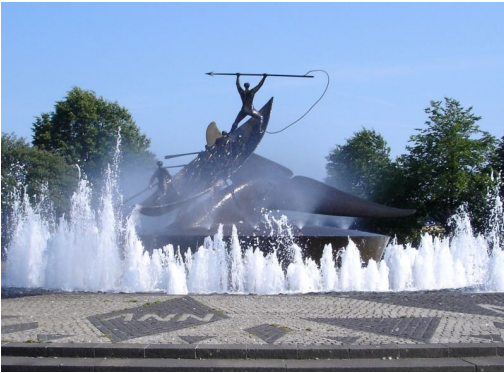
The Whaling Monument – Hvalfangstmonumentet, Sandefjord, Norway

February 2008. New SON Lodge 3 – 679 (soon to be named) Charlotte, NC and the Carolinas