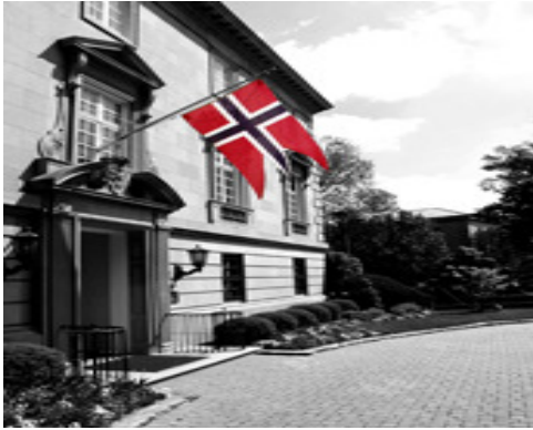
The Royal Norwegian Embassy in Washington

March 2008. New SON Lodge 3 – 679 Norsk Carolina (soon to vote on name) Charlotte, NC and the Carolinas